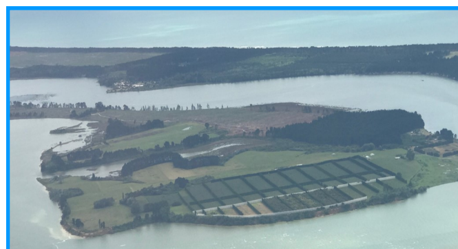
Rangiwaia Island post harvest aerial shot